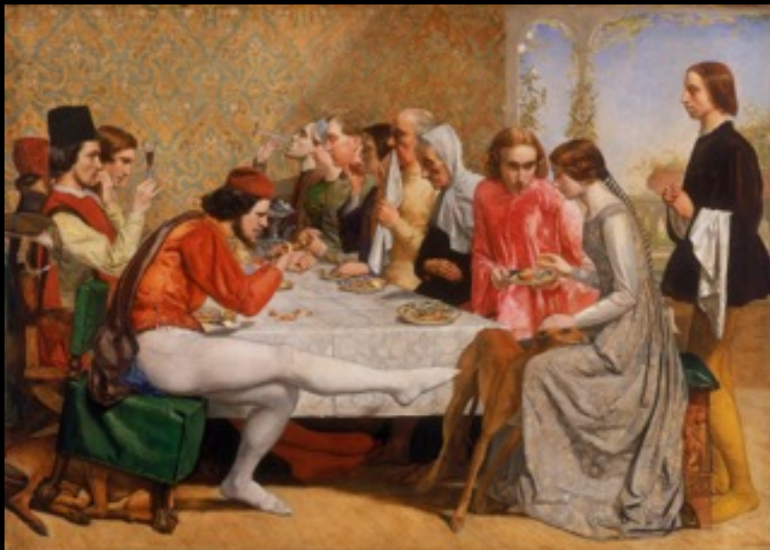
John Everett Millais, Isabella , 1849