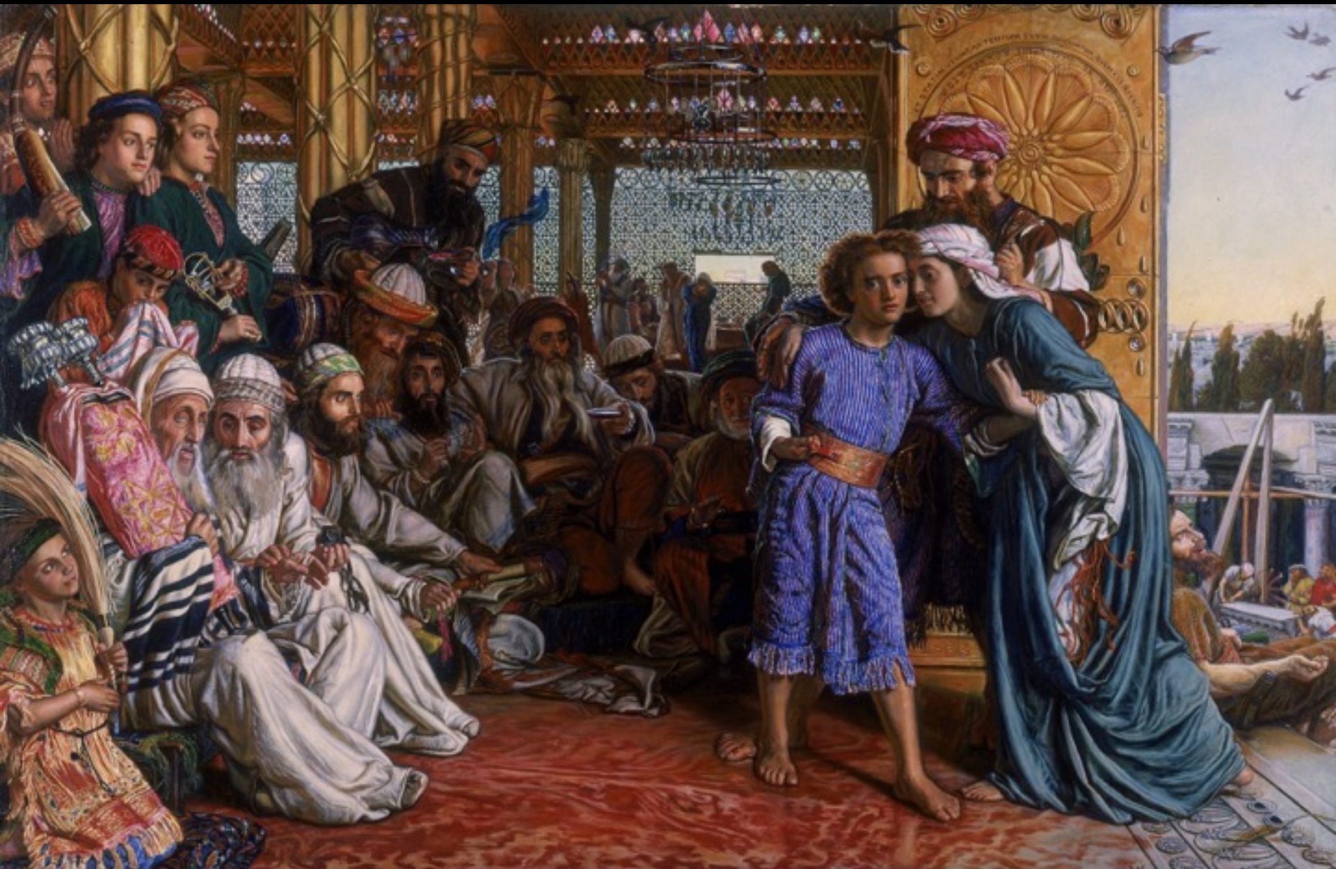
William Holman Hunt, The finding of the Saviour in the Temple , 1854-60