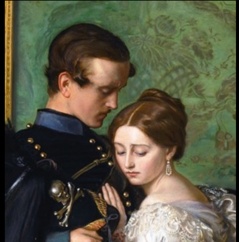
John Everett Millais, The black Brunswicker , 1860