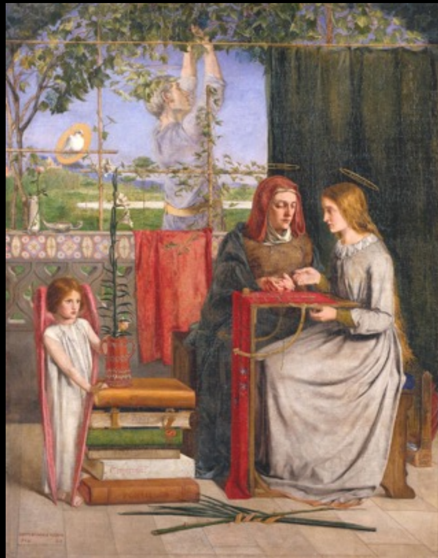
Dante Gabriel Rossetti, The Girlhood of Mary Virgin , 1848-49