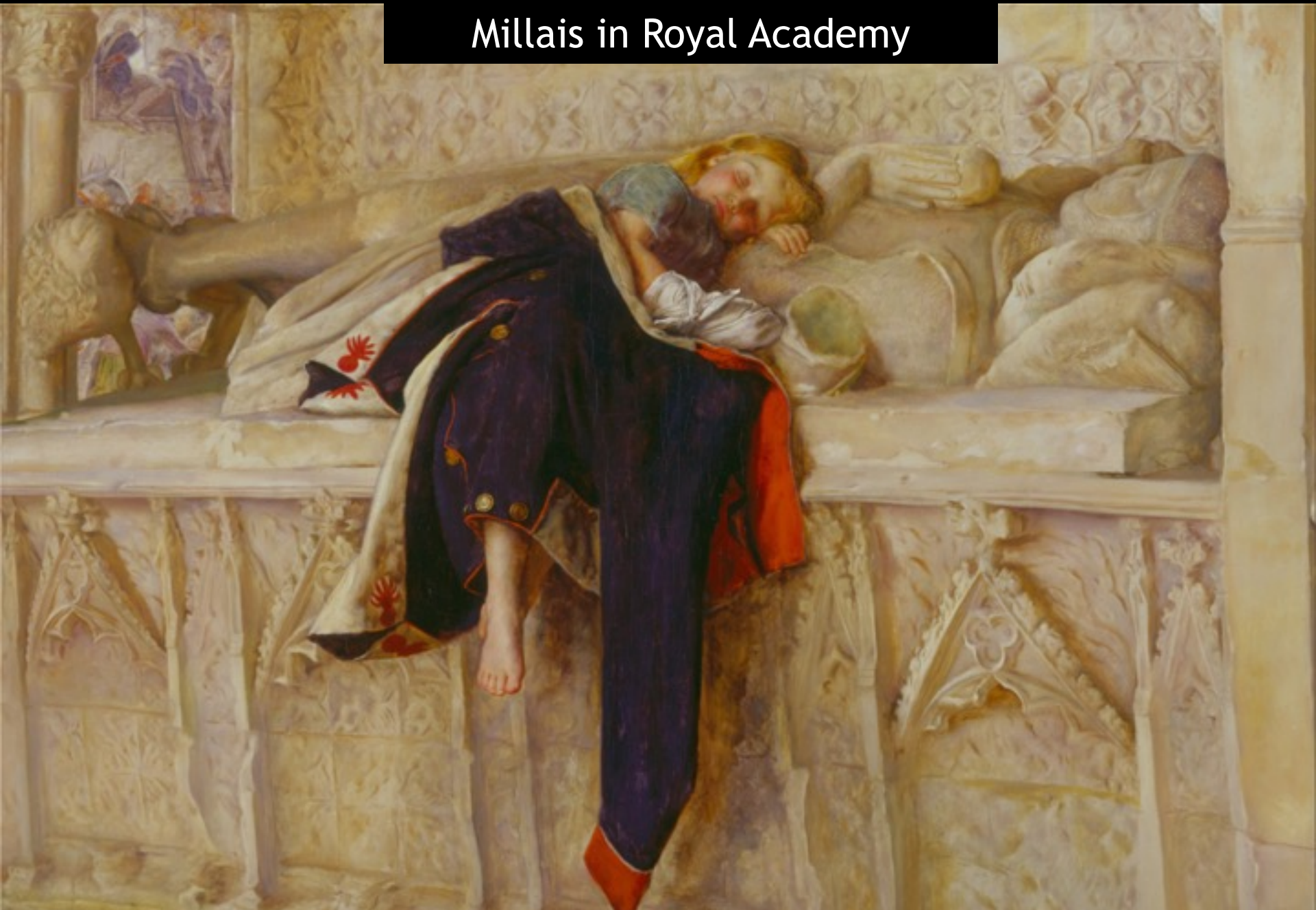
John Everett Millais, L'enfant du regiment , 1855