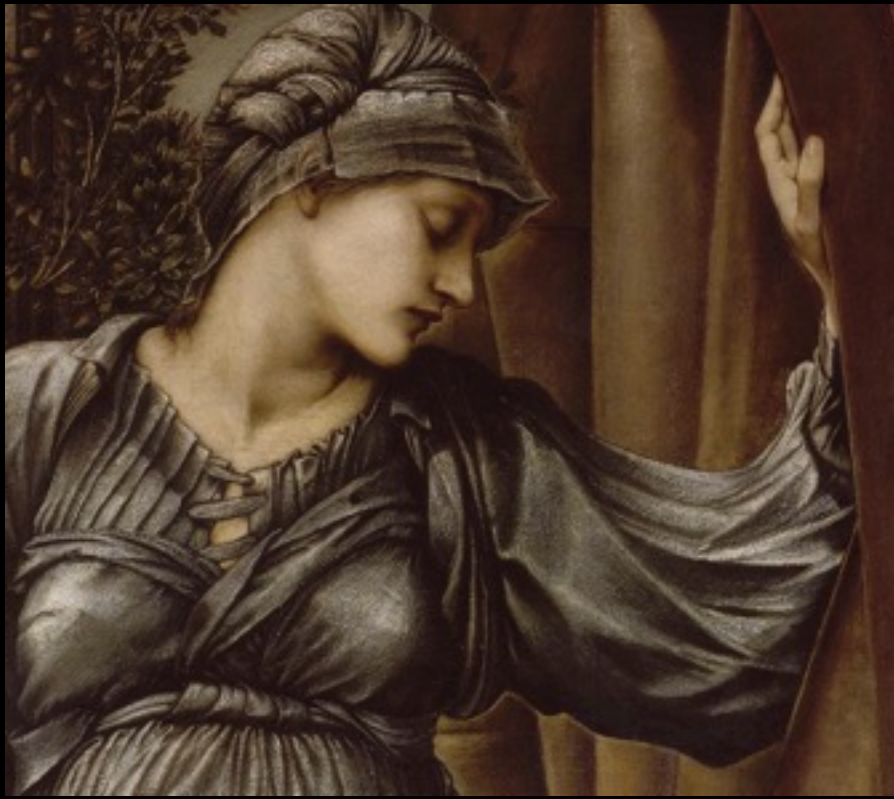
Edward Burne-Jones, The wheel of Fortune , 1875-83