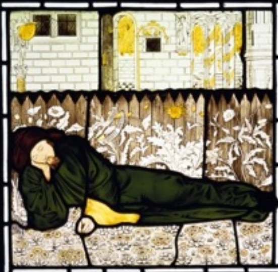
Edward Burne-Jones, Chaucer asleep , 1864