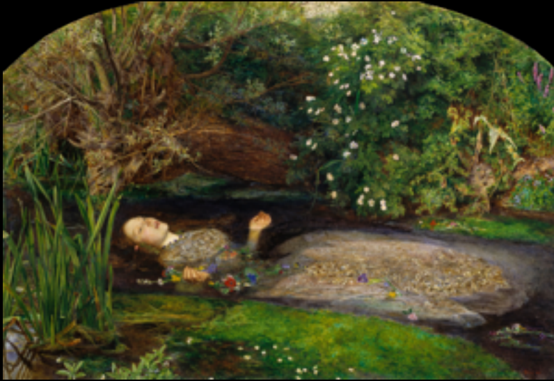
beauty, love and death: english and italian literature