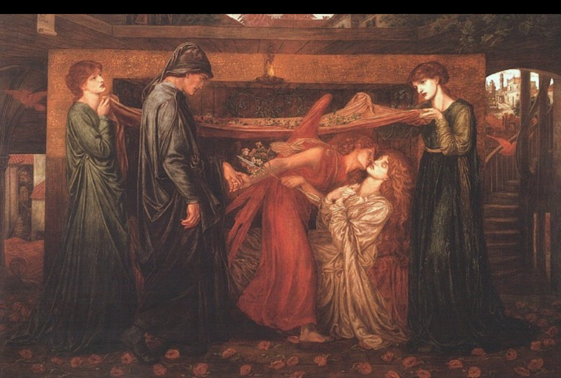
Dante Gabriel Rossetti, Dante's dream , 1871