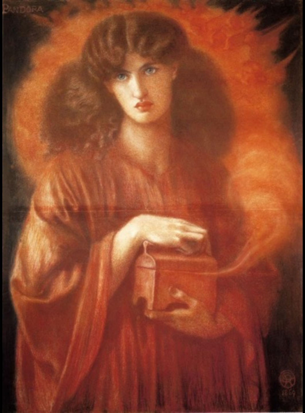
Dante Gabriel Rossetti, Pandora , 1869