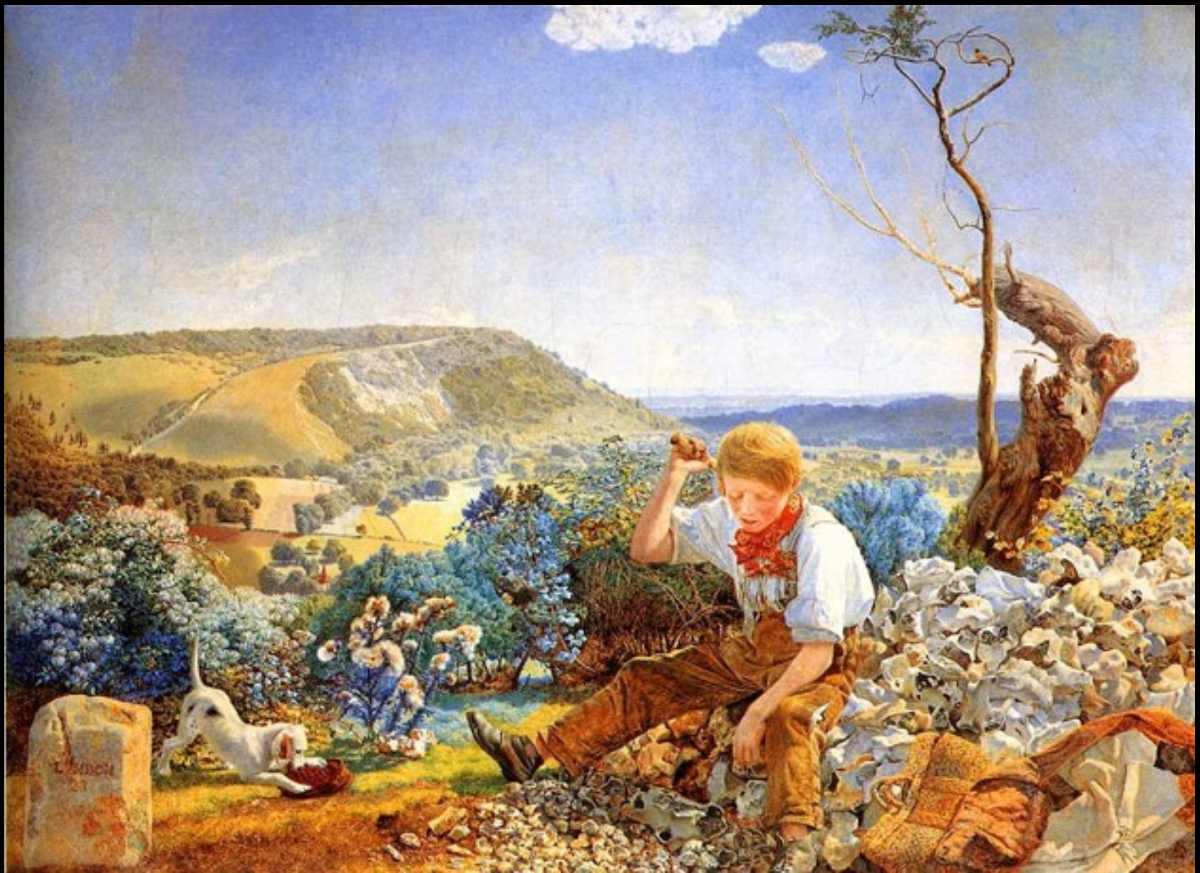
John Brett, The stonebreaker , 1857-58