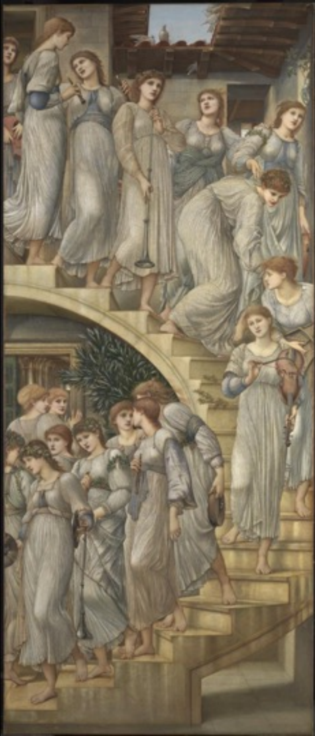
Edward Burne-Jones, The golden stairs , 1880

https://www.khanacademy.org/humanities/becoming-modern/victorian-art-architecture/pre-raphaelites/v/sir-edward-coley-burne-jones-the-golden-stairs-1880