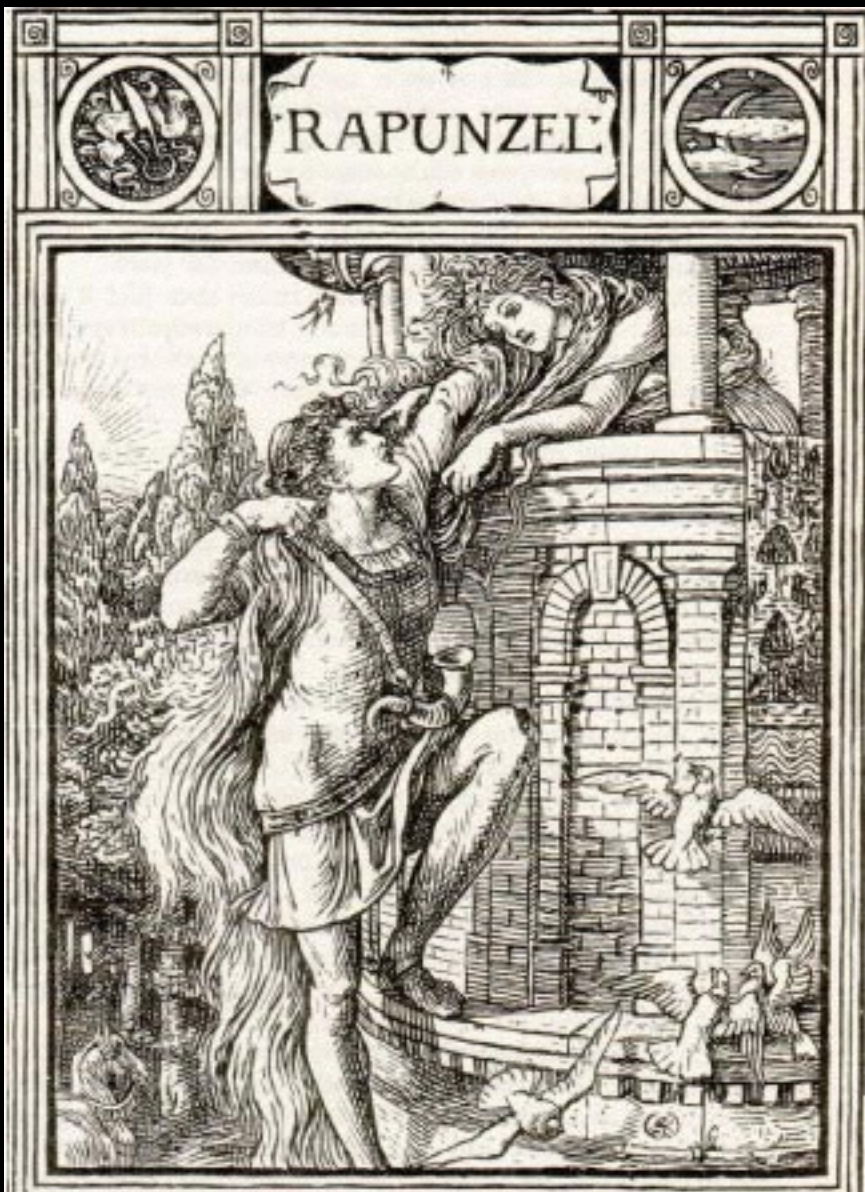
Walter Crane, Rapunzel Illustration, half of the XIX cent.