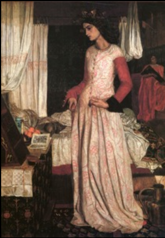
William Morris, Queen Guinevere 1858