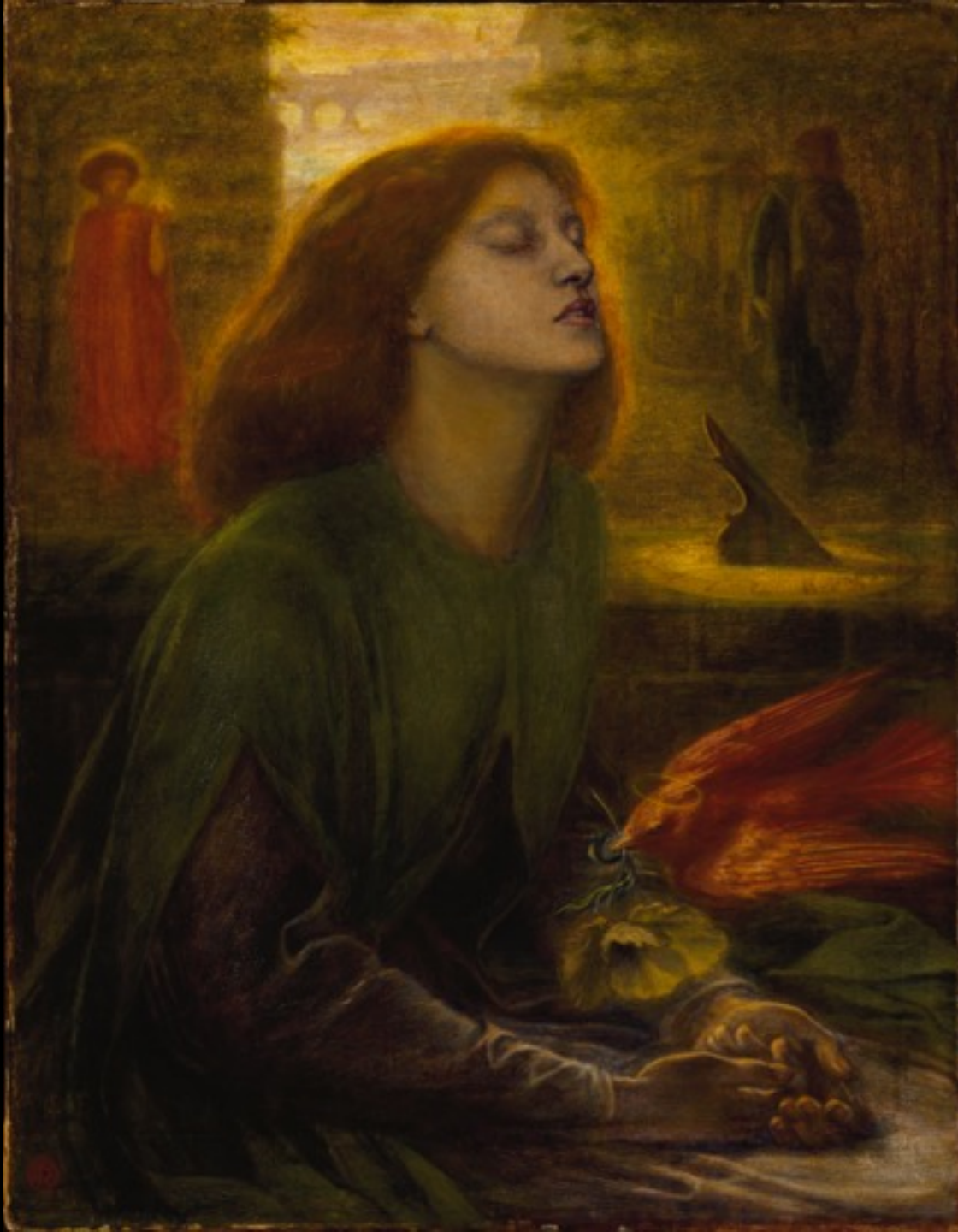
Dante Gabriel Rossetti, Beata Beatrix , 1863