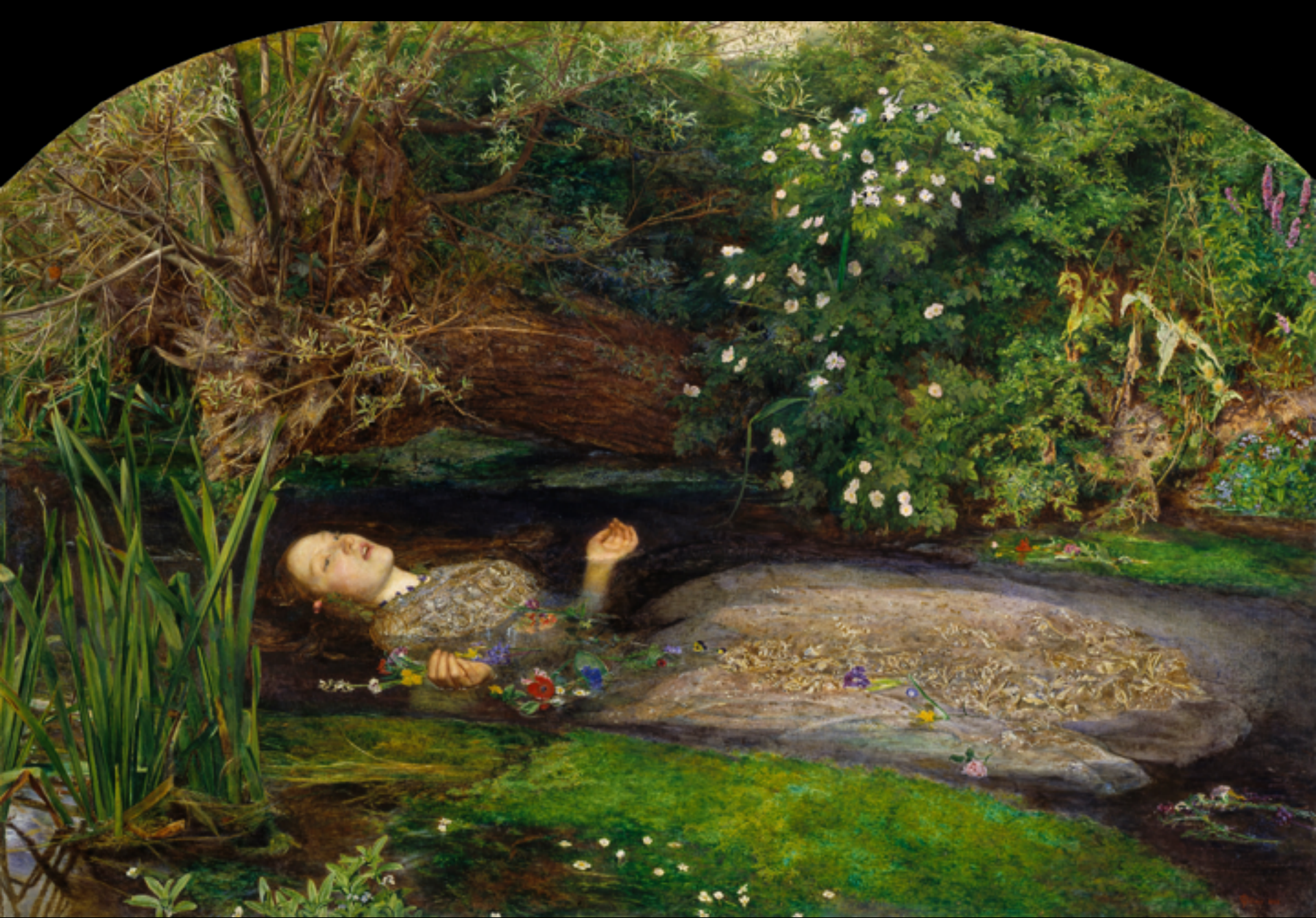
John Everett Millais, Ophelia , 1851-52