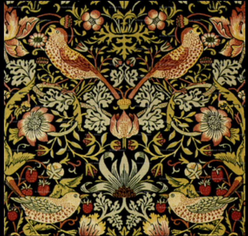
William Morris, Strawberry Thief , 1888