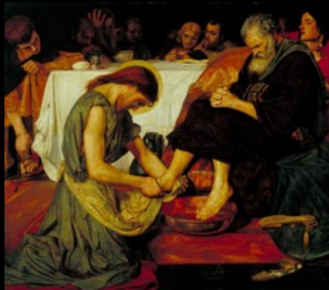
purity and morality: religion and middle ages