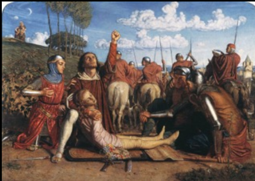
William Holman Hunt, Rienzi , 1849