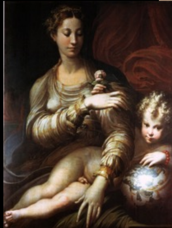
Parmigianino, Madonna of the rose , 1530