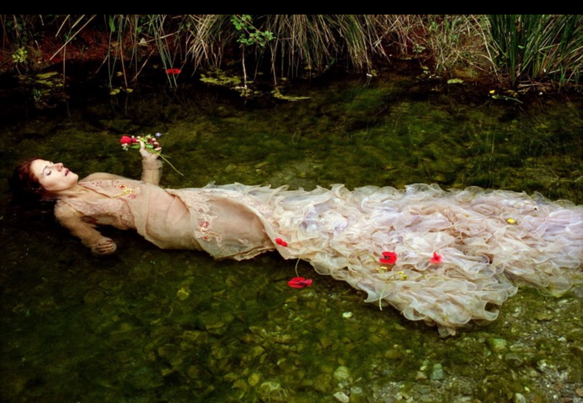
Silvia Camporesi, Ofelia , 2004