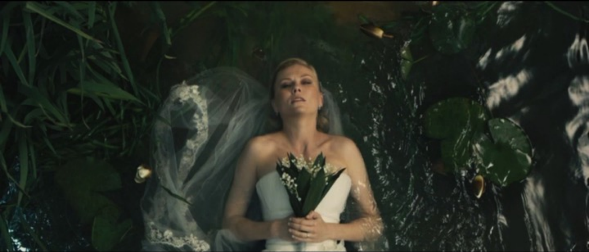
Lars Von Trier, Melancholia , 2011