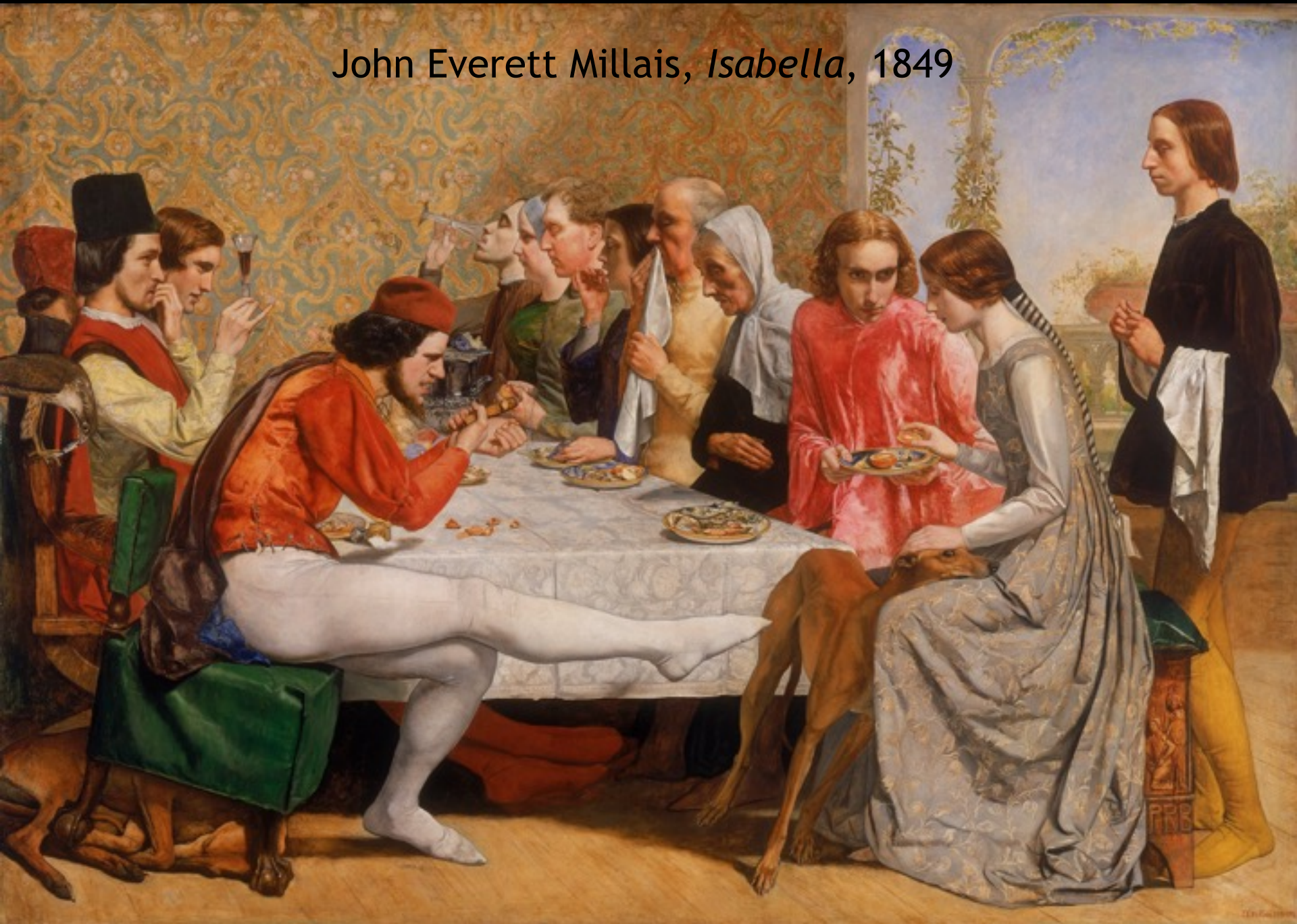
John Everett Millais, Isabella , 1849