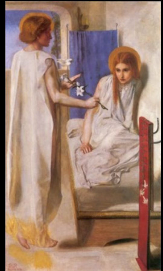
Dante Gabriel Rossetti, Ecce Ancilla Domini , 1849