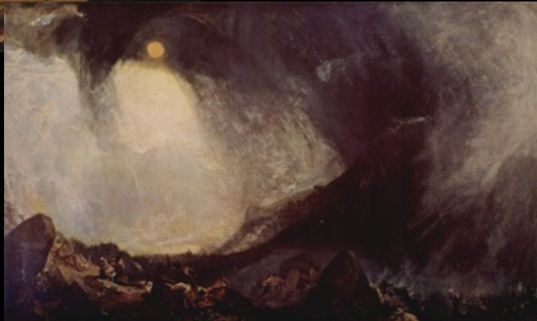
J.M.W. Turner, Snow storm: Hannibal and his army crossing the Alps , 1812