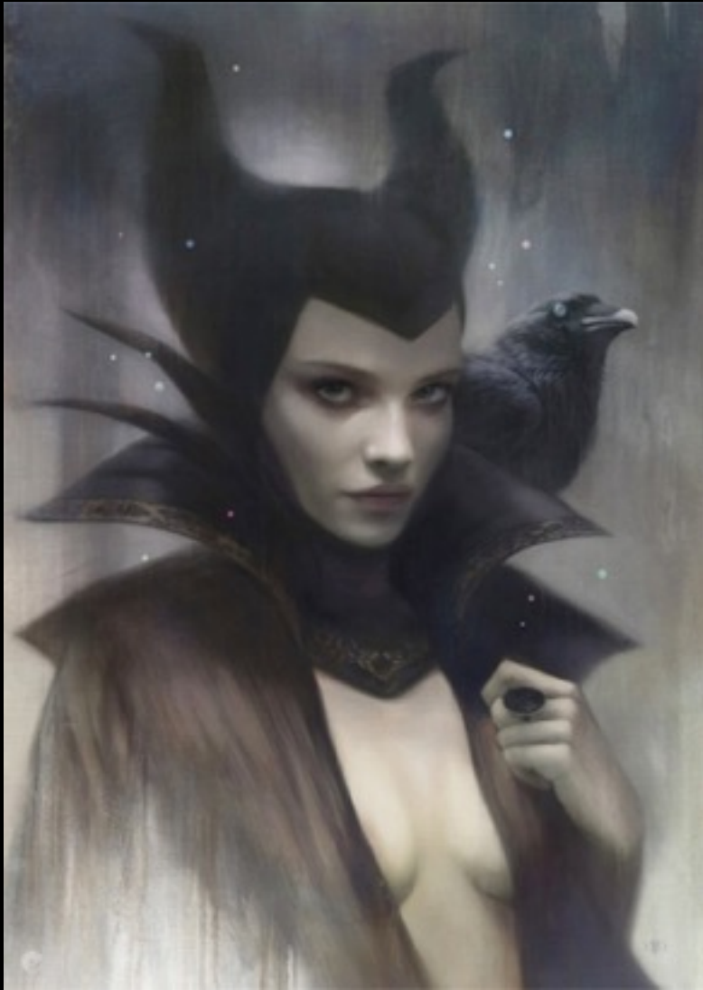
Tom Bagshaw, Evil Intent , 2012