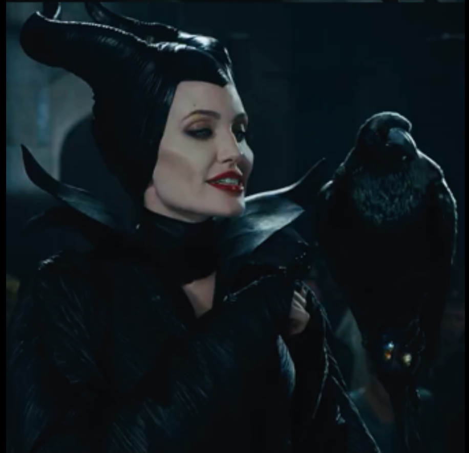
Walt Disney Co., Maleficent , 2014