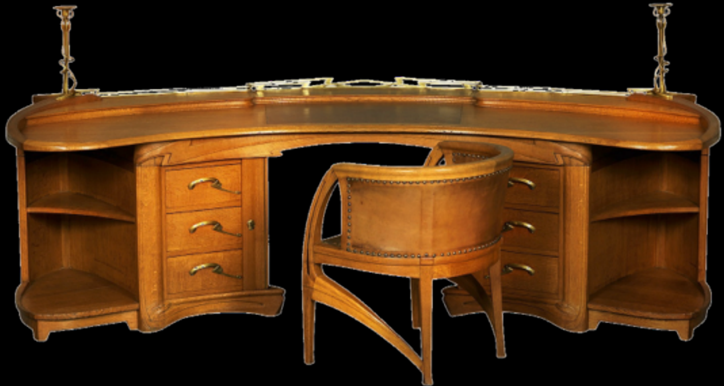
Art Nouveau -> Henry Van de Velde, Desk , 1899

...a successful idea: 130 A&C created in England between 1895 and 1905