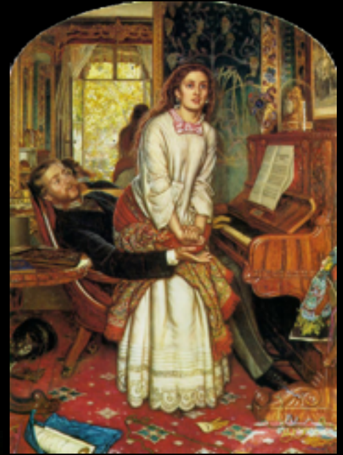
the fallen woman: contemporary age