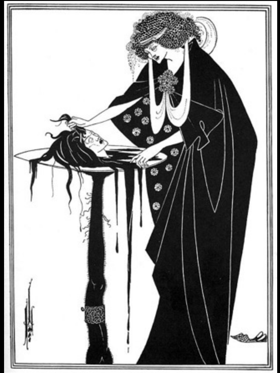
A. Beardsley, The dancer's reward , 1893