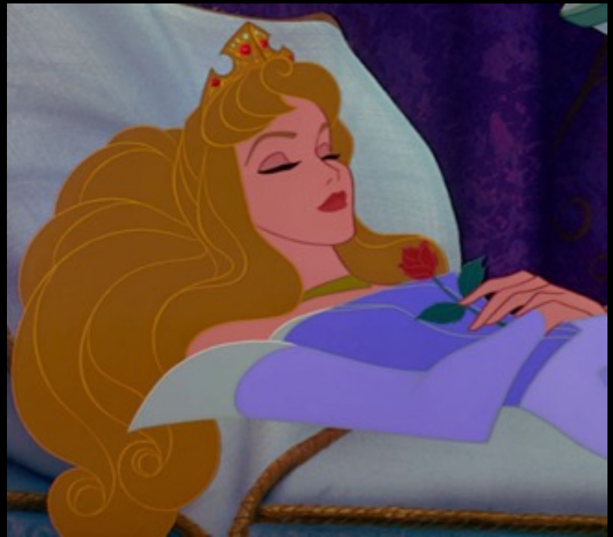
Walt Disney Company, Sleeping Beauty , 1950