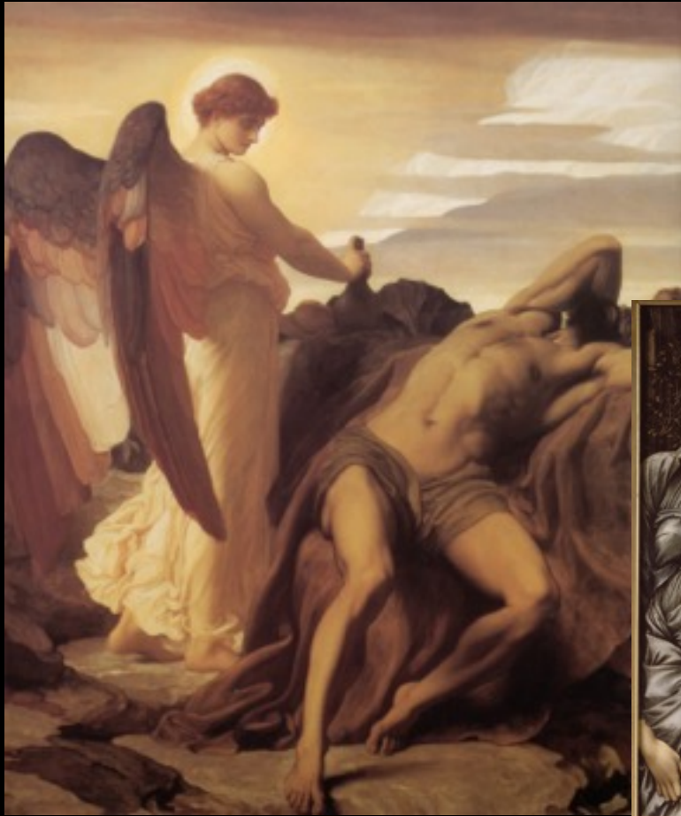
Frederic Leighton, Elijah in the wilderness , 1878