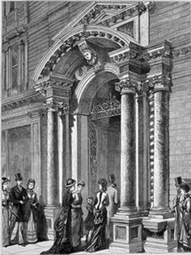
THE GROSVENOR GALLERY, NEW SOUTH STREET—THE ENTRANCE

E. Burne-Jones, F. Leighton and L. Alma Tadema