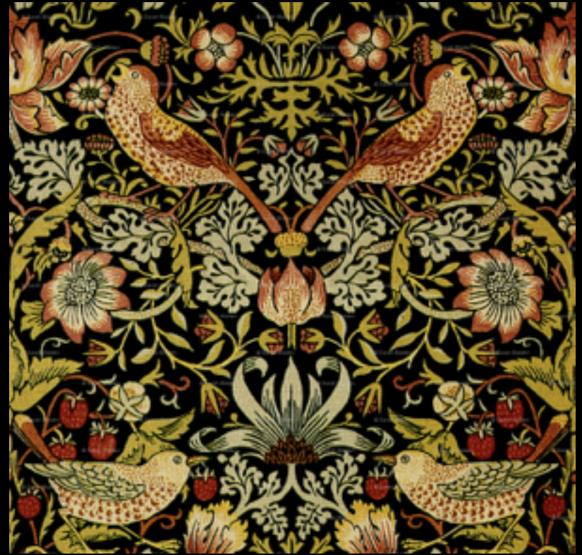
William Morris, Strawberry Thief , 1888