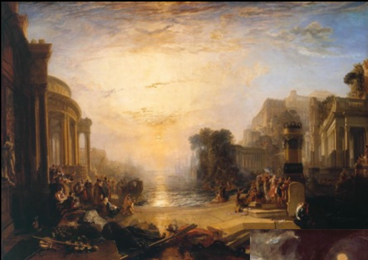
J.M.W. Turner, The fall of the Chartage Empire , 1817