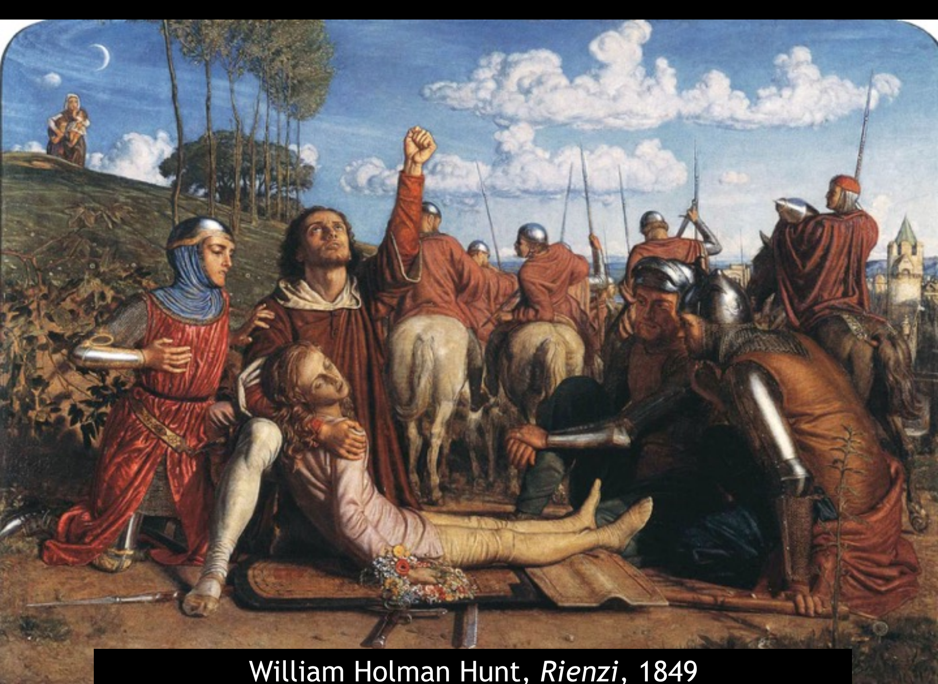
William Holman Hunt, Rienzi , 1849