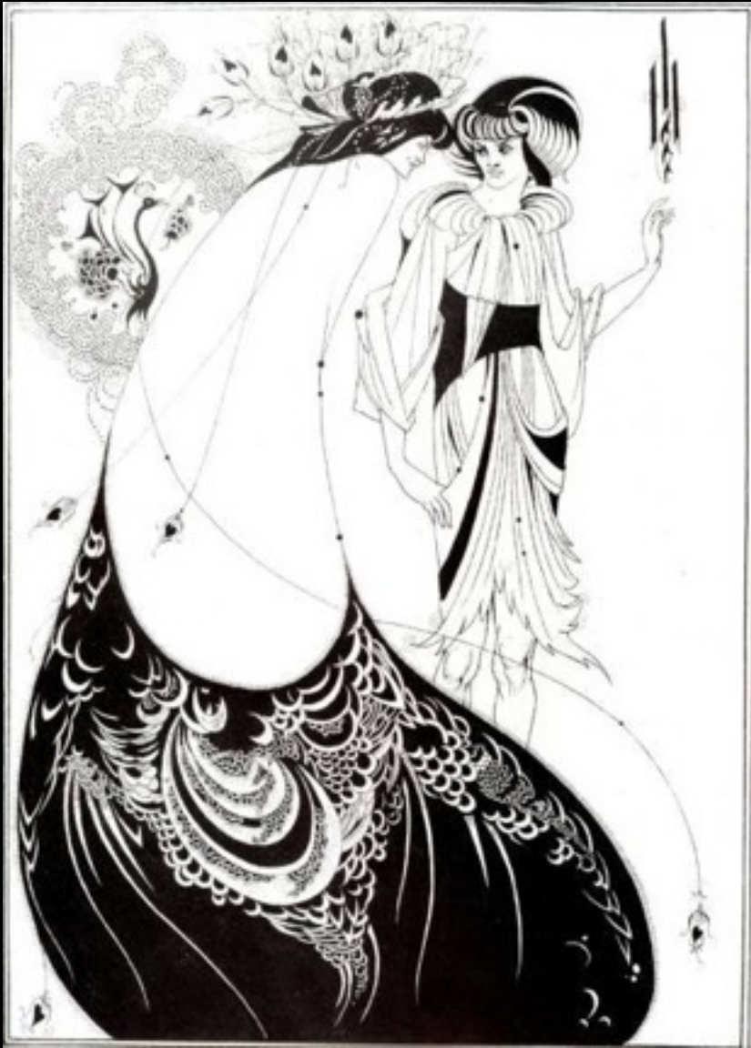
A. Beardsley, The peacock skirt , 1893