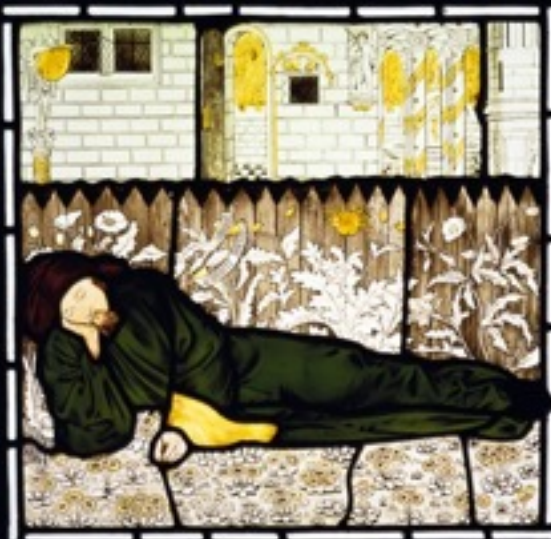
Edward Burne-Jones, Chaucer asleep , 1864