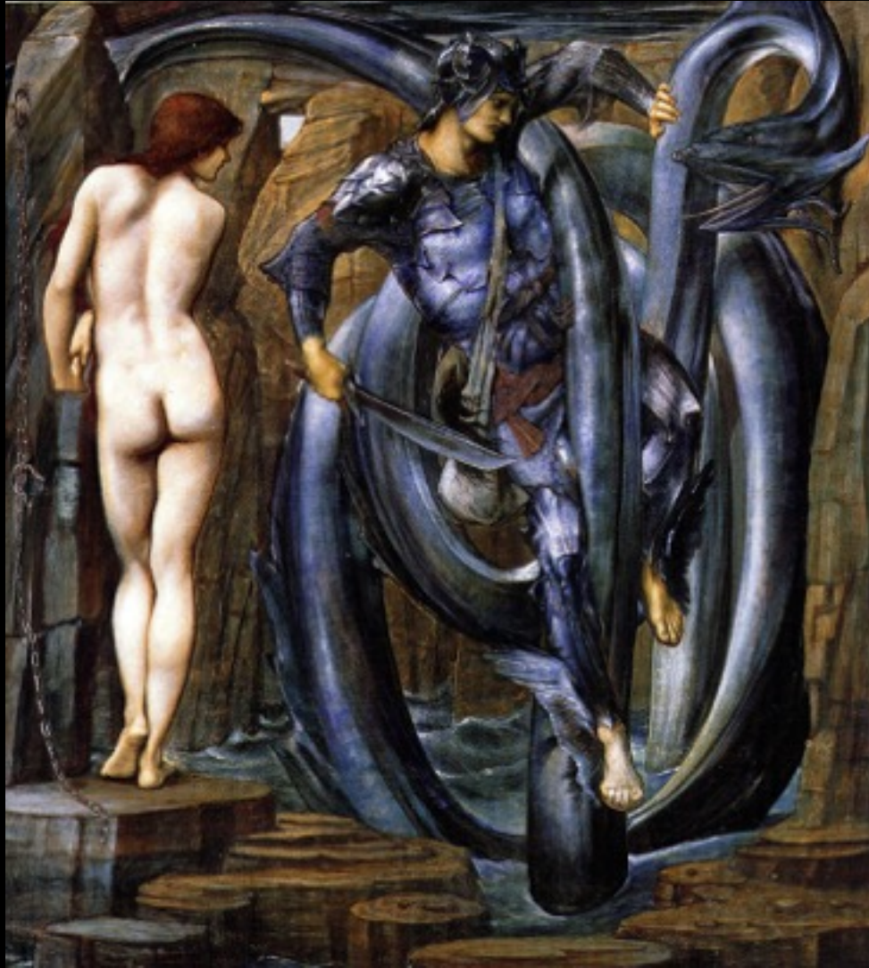
Edward Burne-Jones, The doom fulfilled , 1875-77